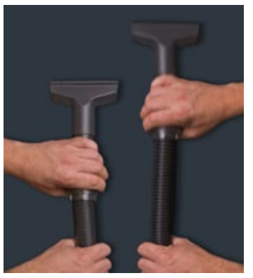
Extendable hose, light weight

Beflexx extendable hose incl. Comfort handle. (0,80 to 3m) Art.100030