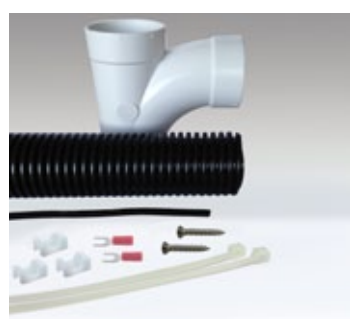
Additional inlet valve

Set of 5 HEPA dust bags + 1 motor filter Art.100026